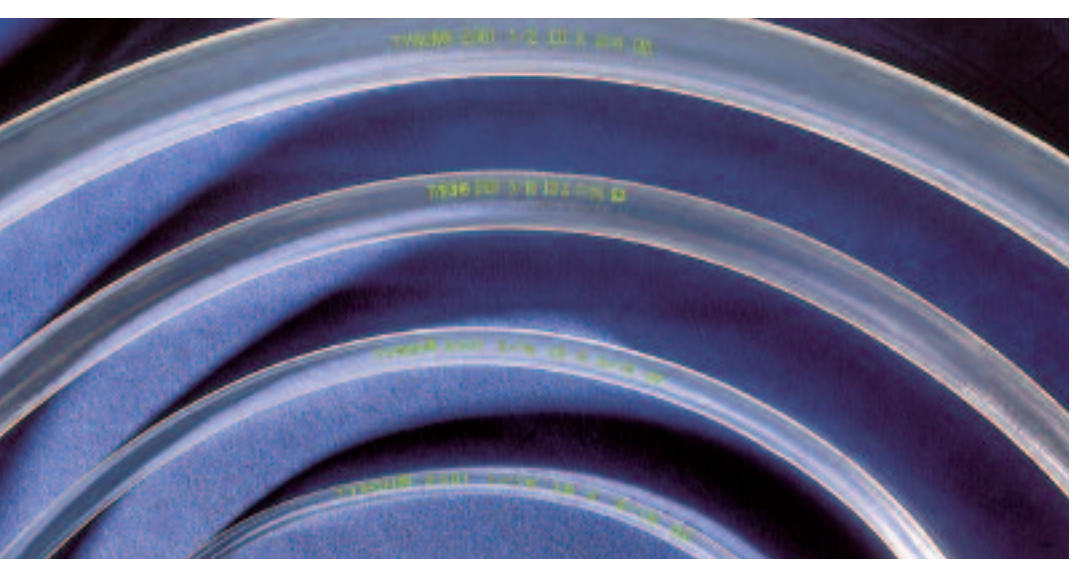
Tygon® Plasticizer Free Tubing resists chemical attack and is a clear, flexible alternative to PVC.